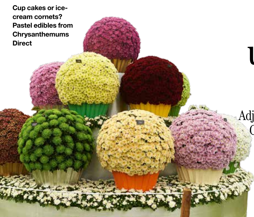
Cup cakes or ice-cream cornets? Pastel edibles from Chrysanthemums Direct