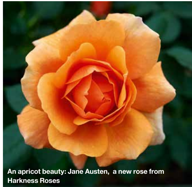
An apricot beauty: Jane Austen, a new rose from Harkness Roses