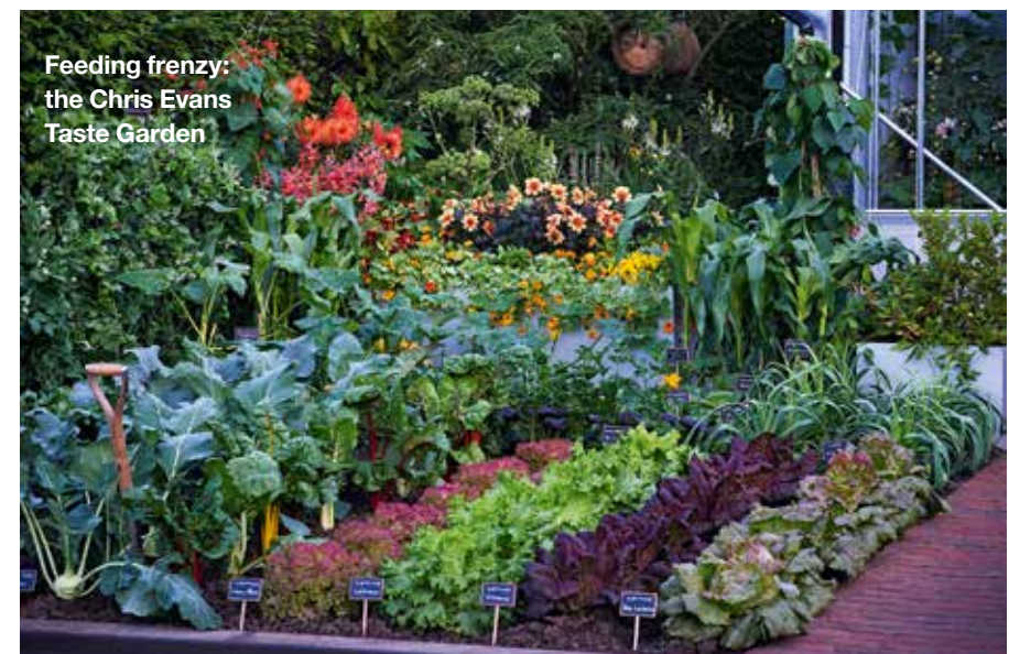
Feeding frenzy: the Chris Evans Taste Garden