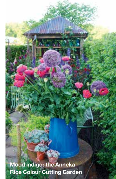
Mood indigo: the Anneka Rice Colour Cutting Garden