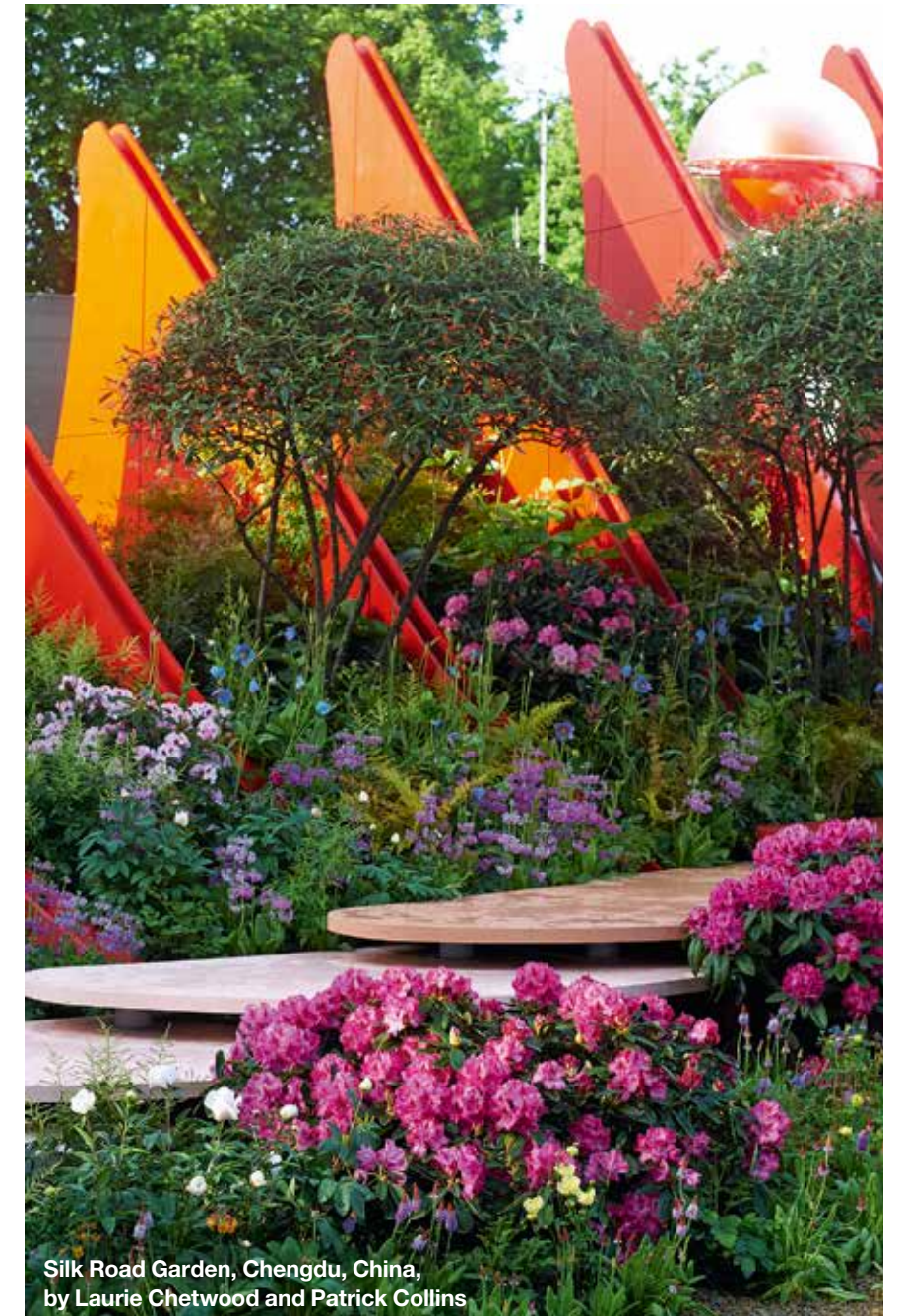
Silk Road Garden, Chengdu, China, by Laurie Chetwood and Patrick Collins