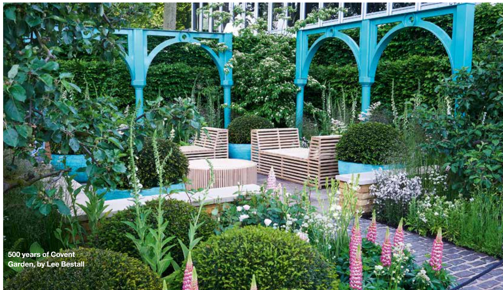
500 years of Covent Garden, by Lee Bestall